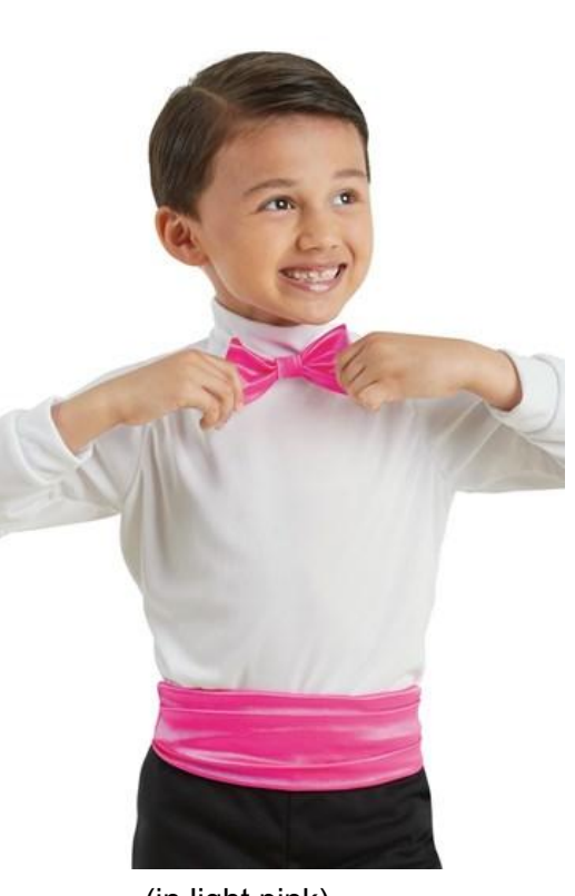
(in light pink)

Tights (Girls): Capezio Ultra Soft Footed Tights in Ballet Pink, Style #1915